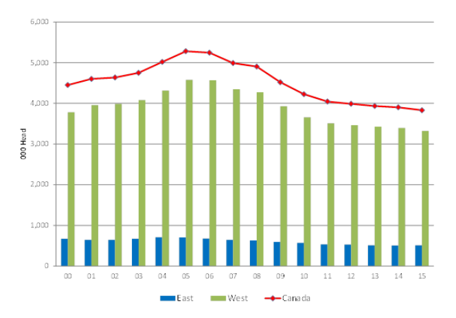
Figure 3 Canadian Beef Cow Herd